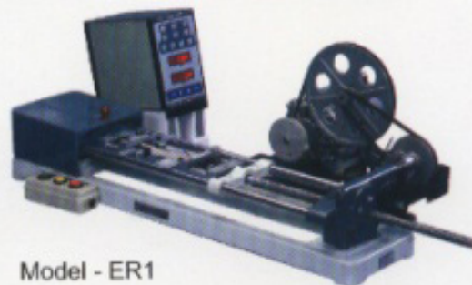
Model - ER1