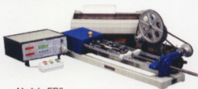
Model - ER3