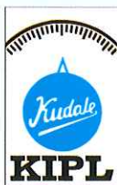
Kudale Instruments (P) Ltd.

(We also offer other model of gear roll tester on demand)